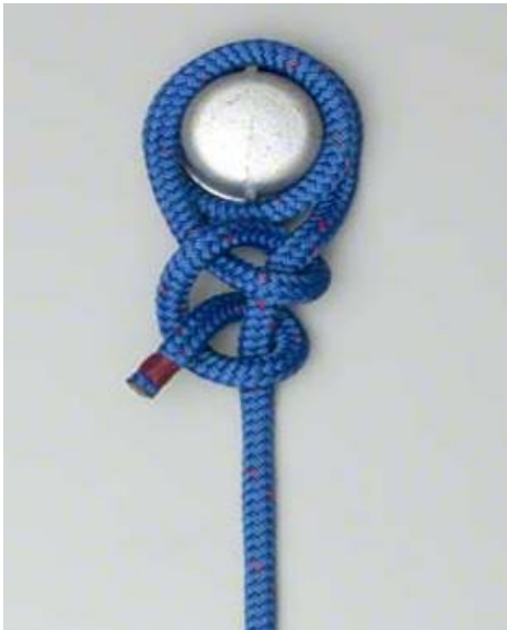
Round turn & 2 half hitches (securing a rope to a pole)