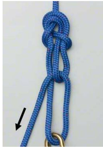
Truckers Hitch (tying boats to a roof rack)