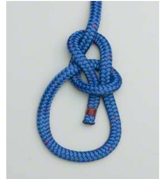
Bowline (making a non-slip loop)