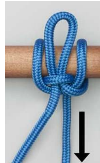
Highwayman's Hitch (quick release knot)