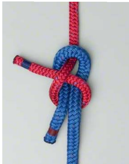
Sheet Bend (Joining Two Ropes)